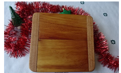
Peter Brotherton - small trivet or cutting board. Method - A sliding dovetail, dowel, wooden anchoring pin