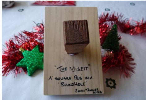
John Tanner - Square peg in a round hole