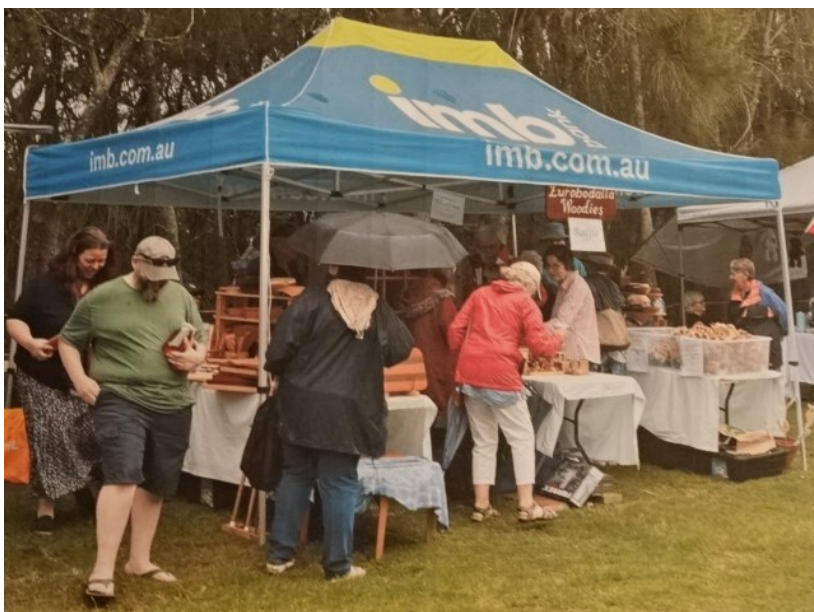
Long Beach Market