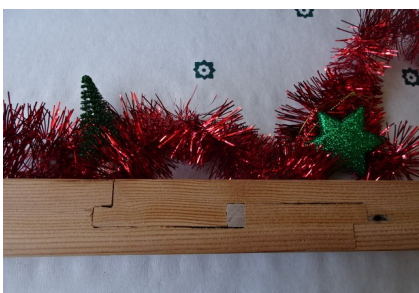
Helmut - Long Japanese join - reusable in that you can pull apart and rejoin