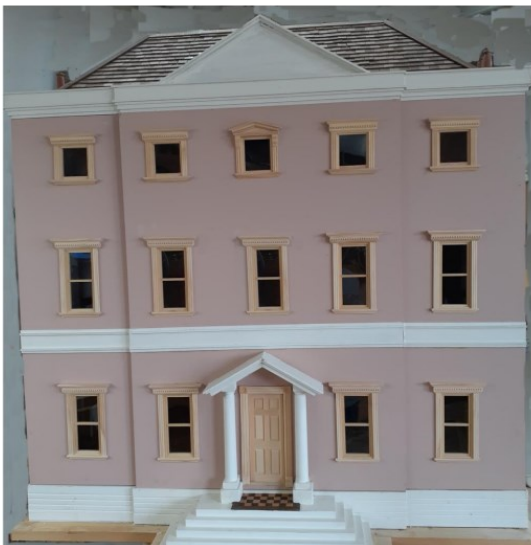
Finished Dolls House

In total, the funds raise by the raffle reached $2,500, so many thanks Eric for all your effort, particularly given so much of your time is taken with trying to get our new Workshop off the ground.