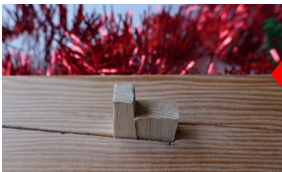
Eric Sims - similar join to Helmut's. Eric said it is often used in boat building