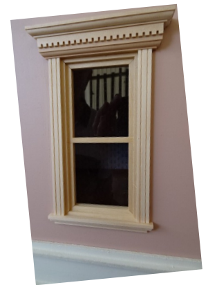
Close-up of the windows.