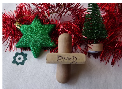
Peter McDowell - Square with hole using pine which expands and contracts a lot. Soak the square and whilst it has expanded hammer the dowel into the hole. When the square dries out and contracts you have a tight join.